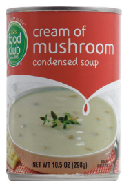
Cream of Mushroom Soup, 10 oz. Count: 1