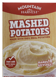
Instant Mashed Potatoes, 13.75 oz. Count: 1