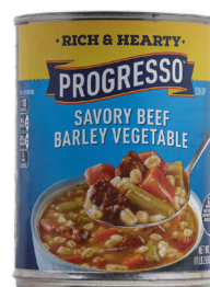
Steak & Vegetable Soup, 18.8 oz. Count: 1