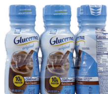
Glucerna® Chocolate Shake, 8 oz. Count: 6