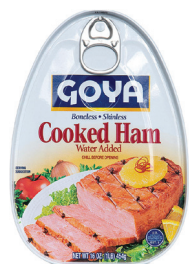
Ham, Cooked, 16 oz. Count: 1