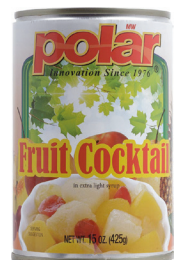
Fruit Cocktail, 14.5 oz. Count: 1