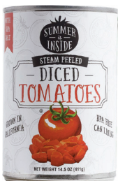
Tomatoes, Diced, 14.5 oz. Count: 1