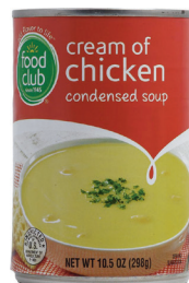
Cream of Chicken Soup, 10 oz. Count: 1