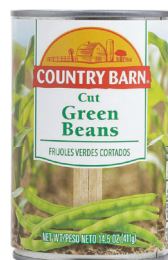
Green Beans, 14 oz. Count: 1