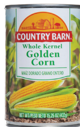
Corn, 14 oz. Count: 1