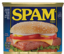
Spam®, 12 oz. Count: 1