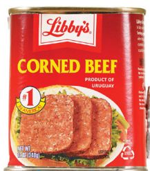
Corned Beef, 12 oz. Count: 1