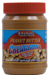
Peanut Butter, Creamy, 16 oz. Count: 1