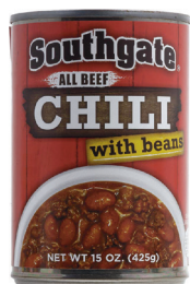
Chili, 15 oz. Count: 1