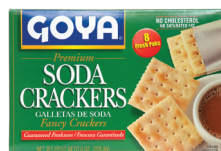
Soda Crackers, 8 oz. Count: 1