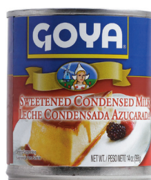
Condensed Milk, 14 oz. Count: 1