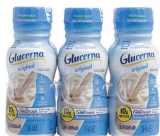
Glucerna® Vanilla Shake, 8 oz. Count: 6