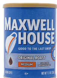
Coffee, 11 oz. Count: 1