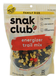
Trail Mix, 16 oz. Count: 1