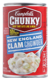
Clam Chowder, 18 oz. Count: 1