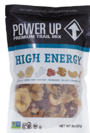
Fruit & Nut Mix, 6 oz. Count: 1