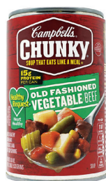
Chunky Vegetable Soup, 18 oz. Count: 1