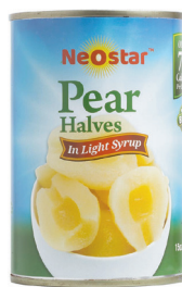
Pear Halves, 15 oz. Count: 1